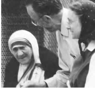
The author and his wife with Mother Teresa