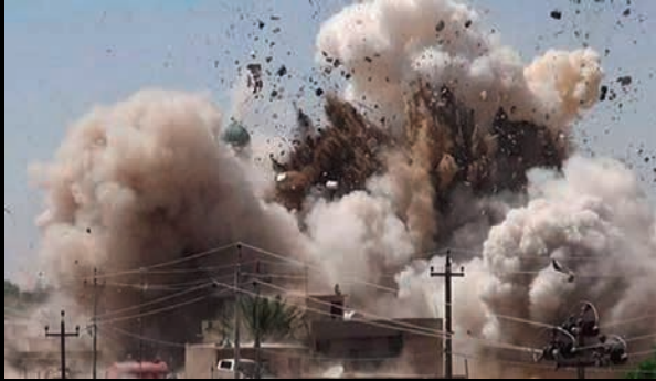
Destruction of Mar Gorgees Church, Mosul, Iraq