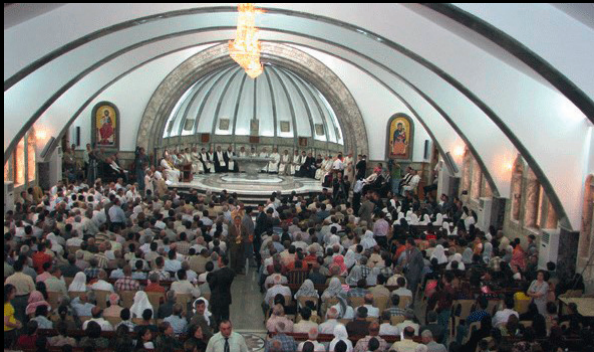
Inside the Church of Saints Behnam and Sarah

This is a preview. Get the entire book here.