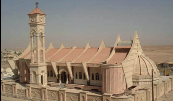
Church of Saints Behnam and Sarah, Qaraqosh, Iraq