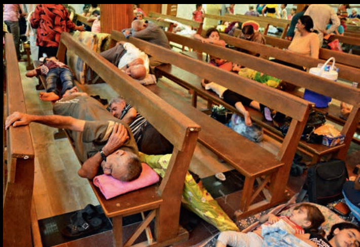
A camp for internally displaced people and refugees in Ankawa, Iraq