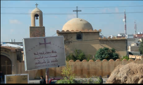
Church of Mar Gorgees, Ankawa, Iraq